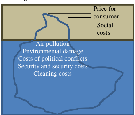
Fig. 2: Public expenditure on fossil energy sources 15

5) It is necessary to consider the financial aspect of the issue, because without financial motivation from the state it is impossible to carry out institutional transformations at the micro level. It is necessary to envisage state investments in pilot RES projects, on fundamental and applied research, and on R&D of the most promising technologies.